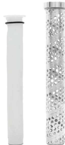
Rosedale® Model MBII Bag & Strainer Item#: 11-19565 Part#: BASKET MINI BAG II 1/8" PER 316