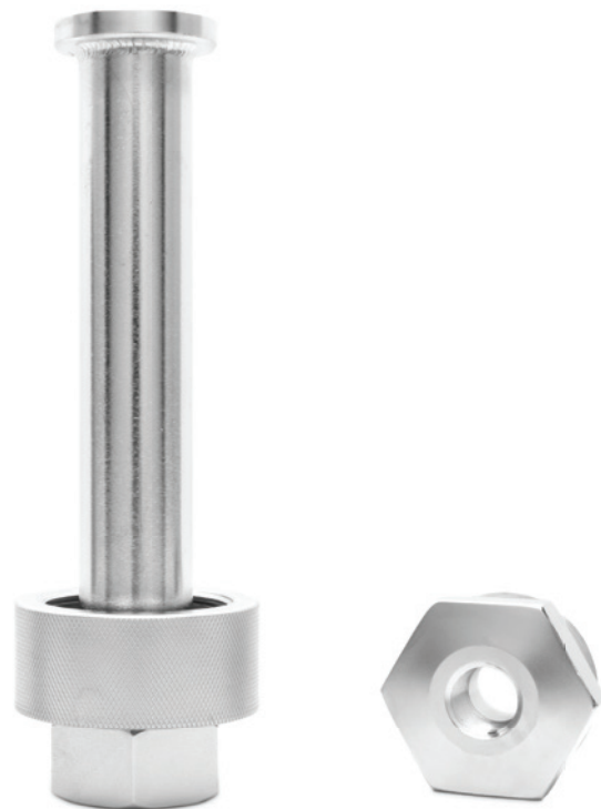
Rosedale® Model MF-1