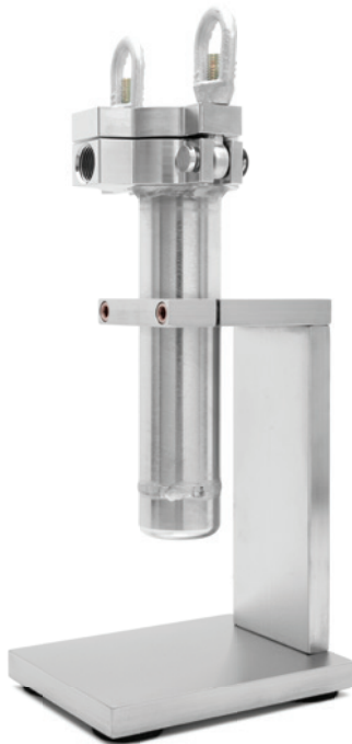
Rosedale® Model MBII Mounting Stand Kit Item#: C28865.40.2 Part#: STAND ASSY MINI BAG II 304